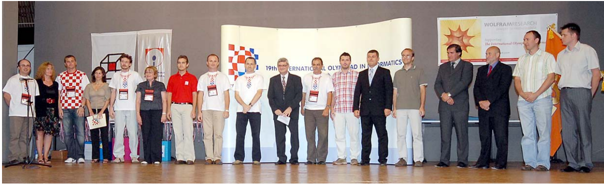
IOI 2007 Organizers

19 th International Olympiad in Informatics – IOI 2007 has been officially closed on Tuesday, August 21, 2007. All of the participants of IOI 2007 (wearing their team's official colours this time) and numerous guests (among which we should point out the presence of renown politicians, sponsors and esteemed young computer scientists, former Olympiad contestants) gathered at the «Globus» Congress Centre at the Zagreb Fair.